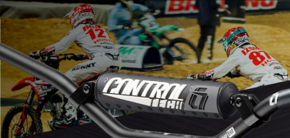
7/8" HANDLEBAR HIGH RISE