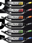
MOTOCROSS HANDLEBAR MEDIUM RISE