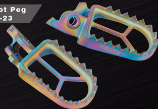
Titanium Foot Peg HONDA AFP-23