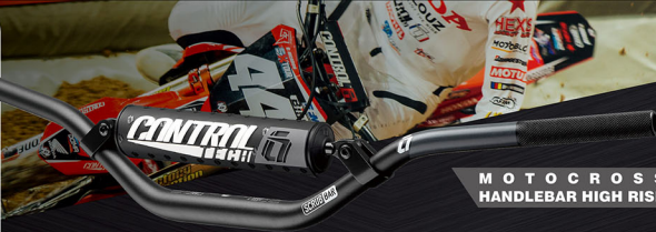
MOTOCROSS HANDLEBAR HIGH RISE