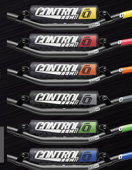
MOTOCROSS HANDLEBAR LOW RISE